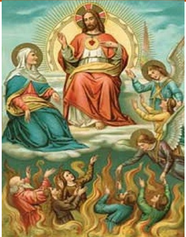
The Month of the Souls in Purgatory